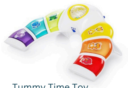
Tummy Time Toy