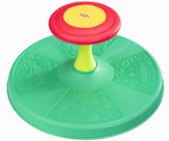
Sit & Spin