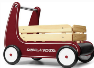
Classic Walker Wagon