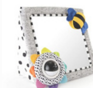
Tummy Time Mirror