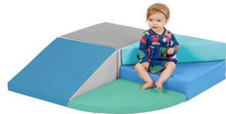
Soft Play Mats