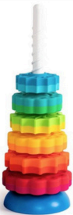
Spin Again Stacking Toy