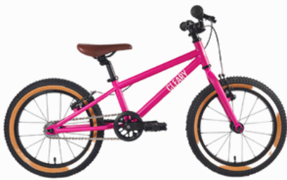
Bike with Removable Training Wheels

Favorite Brands: Cleary, Woom, Guardian, and Specialized (based on child's size and ability level)