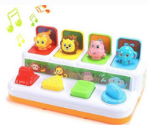
Pop Up Music