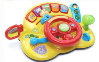
Turn & Learn