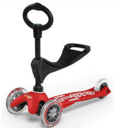
Micro 3-in-1 Kickboard