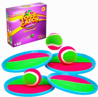
Catch & Toss