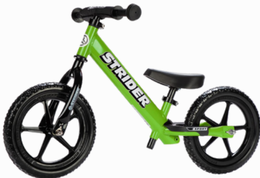
Strider Balance Bike