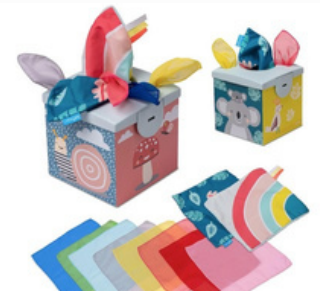
Crinkle Tissue Box