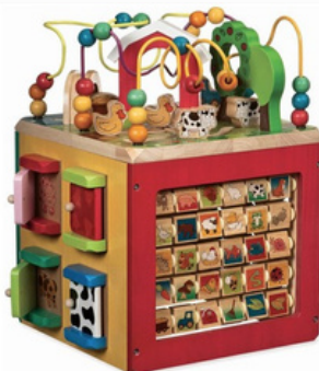
Large Wooden Activity Cube