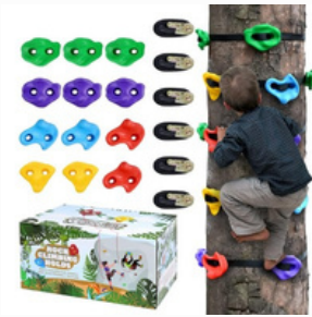
Outdoor Rock Wall