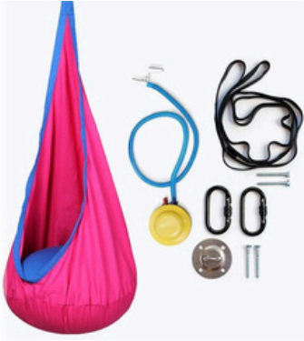
Sensory Pod Swing