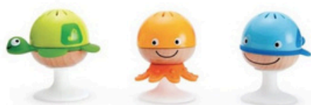
Suction Cup Rattles