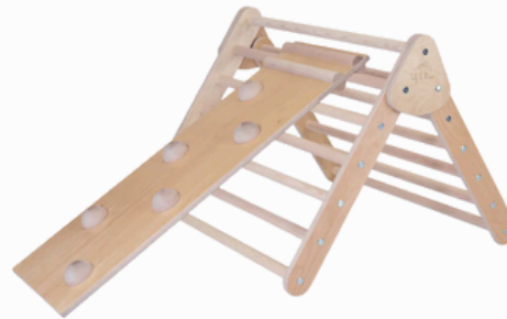
Little Climber Pikler Triangle from Lily & River