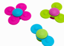
Suction Cup Spinners