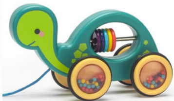
Push & Pull Turtle