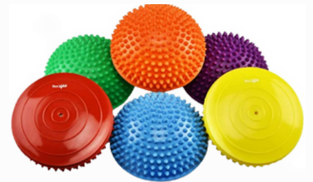
Sensory Stepping Stones