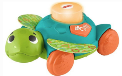
Sit to Crawl Turtle