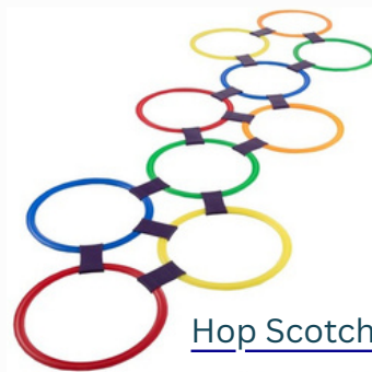
Hop Scotch Rings

Favorite Brands: Cleary, Woom, Guardian, and Specialized (based on child's size and ability level)