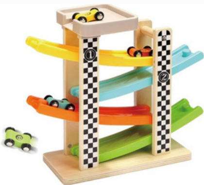
Wooden Race Track