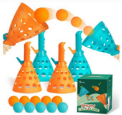
Pop & Catch