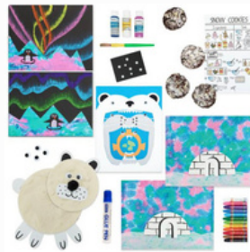
Kid's Art Subscription Box