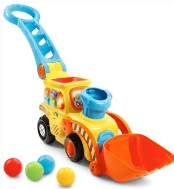
Single-Hand Push Toy